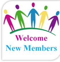
New Members Day